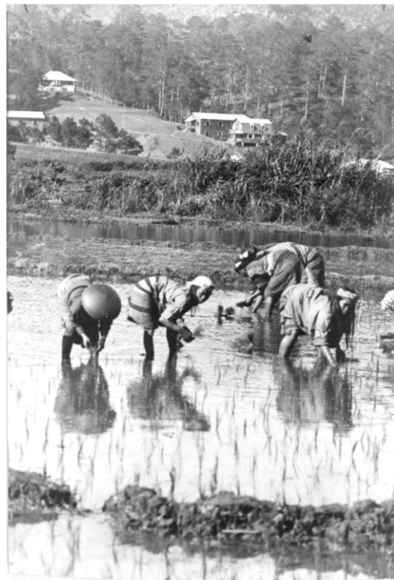
Filipinos planting rice, Philippine Islands, ca.1890 - 1925

Ph.D. History, University of the Philippines, 2005